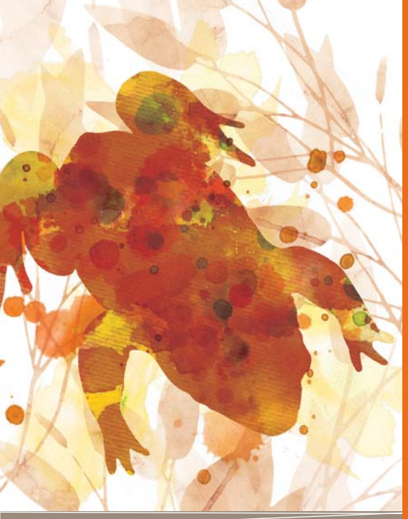
Fruit, Frogs & Family Fun Ruffey Lake Park Walk